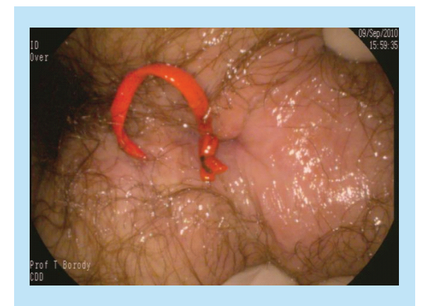
Figure 5. Pretreatment – perianal fistula.

weeks. A marked reduction in stool frequency was also observed to one formed stool per day from her baseline of >10 stools per day. There was no associated urgency, pain or tenesmus. She has remained asymptomatic without recurrence of fistulae over the last 7 years on a maintenance dose of anti-MAP therapy alone.