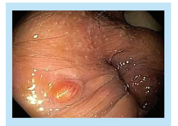
Figure 11. Pretreatment - fistula opening.

higher than comparable data for each of the three therapies individually, and indeed any available treatments [10,16-17]. Fistulizing CD frequently presents a therapeutic challenge and significantly impacts on patients' quality of life. Certain medications that are useful for the treatment of active Crohn's disease may be counterintuitive in the treatment of CD fistulae (e.g., corticosteroids), and can in fact be detrimental [18]. Biologics such as infliximab have improved fistulae treatment - otherwise most cases are intractable and require 'seton' placement to prevent abscess formation. While the initial response to infliximab can be dramatic, the median duration of fistula closure is approximately 3 months [19]. In the initial infliximab Phase II and subsequent Phase III trials, 56-68% of fistulae initially healed in 296 patients [1,2]. In the ACCENT 2 trial, there was a 60% response rate of fistulae after 14 weeks. However, on an intention-to-treat basis, at one year only approximately 20% of fistulae healed in patients treated with infliximab [8]. This leaves the vast majority of patients experiencing continued fistulizing activity, with a subgroup of these patients progressing to proctectomy and a permanent stoma [16,18]. In addition, not all fistulae respond to infliximab. Rectovaginal fistulae