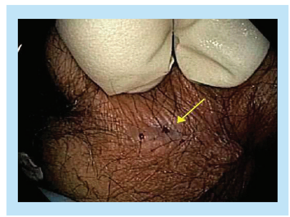
Figure 10. Post-treatment – healed fistula opening.

In this difficult-to-treat population of patients with severe, active CD, who had previously failed conventional therapies (including 5ASA, steroids, infliximab, thiopurines and anti-MAP), combination therapy with infliximab, HBOT and anti-MAP therapy achieved 100% fistulae healing rates in this small cohort. This healing persisted for an average of 18 months with continuation of anti-MAP but on stopping anti-MAP fistulae returned in one patient. This appears to be