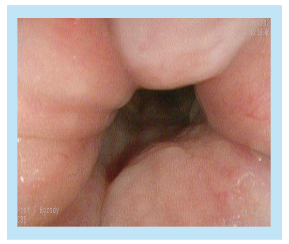
Figure 9. Post-treatment – healed mucosa.

intersphincteric space with a small collection in the lower-third of the rectal wall. The patient experienced chronic perianal sepsis as a result, which was resistant to treatment and drainage (Figures 11 & 12). A partial proctocolectomy was performed. Following one years' treatment with anti-MAP therapy, eight courses of infliximab and 21 sessions of HBOT. The patient underwent an ileorectal reconnection, with complete healing of CD and resolution of fistula, and remains on anti-MAP maintenance therapy alone (Figures 13 & 14).