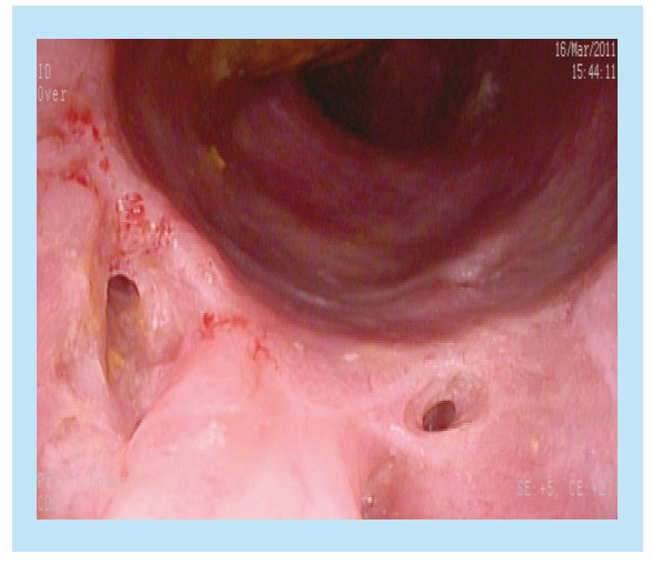
Figure 1. Pretreatment – multiple fistulae and inflammatory changes.

treatment with infliximab alone. On colonoscopy, active, ulcerating CD was confirmed, with a visible fistula opening (Figure 3). Combination therapy consisted of four infliximab infusions, 21 HBOT sessions and anti-MAP therapy (Table 1). After 3 months, the patient reported increased energy, resolution of bowel symptoms and the return of previously absent menses. Complete rectal and vaginal fistula healing was observed on colonoscopy (Figure 4). Subsequent MRI showed disappearance of the original abnormalities in the anorectal area with no gascontaining locus and absence of the rectovaginal fistula. However, feeling so well at follow-up she decided to discontinue anti-MAP therapy and her symptoms recurred and fistula reopened.