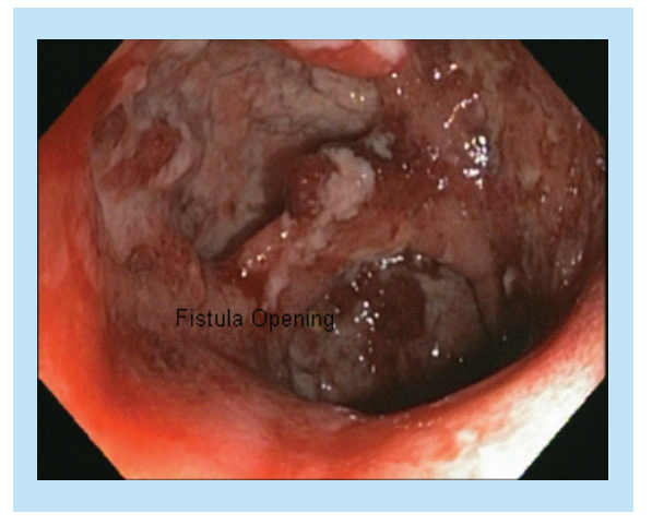
Figure 3. Pretreatment – rectovaginal fistula.

A 31-year-old male with a 10-year history of CD presented with lower abdominal and rectal pain, bloating, flatulence, fecal urgency and soiling. On colonoscopy, the patient had a posterior anal fissure and an inter-