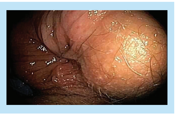
Figure 13. Post-treatment - healed opening.

Due to their location, perianal fistulae are frequently prone to coexisting infection as a result of stool bacterial contamination. Fistulae are proposed to persist due to ongoing ischemia and persistent colonization with anaerobic microorganisms [22]. HBOT is a novel treatment targeting anaerobic bacteria colonizing CD fistulae. Due to the mechanism of action of HBOT, its potential value in fistulae treatment has previously been recognized [23]. Higher atmospheric oxygen environment during HBOT creates unsuitable conditions for anaerobe survival. HBOT also inhibits active inflammation, in part by suppressing TNF- \alpha , IL-1 and IL-6 and enhancing host antibacterial responses [16,24]. Furthermore, HBOT decreases neopterin, myeloperoxidase activity and oxidative stress markers, whilst stimulating angiogenesis [25]. Sporadic case reports of Crohn's perianal disease achieving complete healing on HBOT and